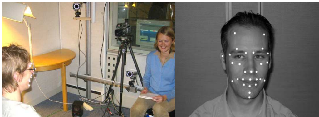
Figure 1. Data collection setup with video and IR-cameras, microphone and a screen for prompts (left) and a test subject with the IR-reflecting markers (right).

resynthesis of an animated head. The opto-electronic motion tracking system, the Qualysis MacReflex system, that we use has an accuracy better than 1 mm with a temporal resolution of 60 Hz. The data acquisition and processing is similar to earlier facial measurements carried out at CTT by e.g. Beskow et al. (2003). The set-up can be seen in Fig. 1, left picture.