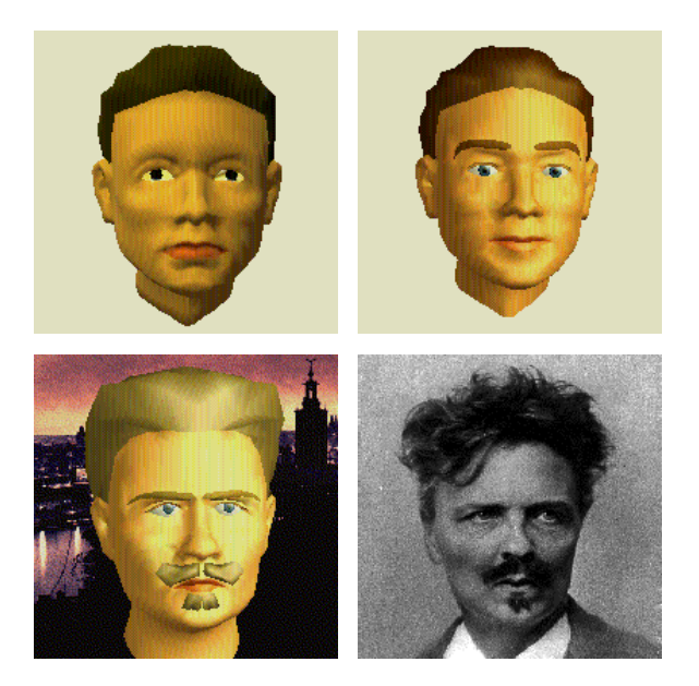
Figure 1: Top row: The static 3D-model from Viewpoint DataLabs, and the talking agent Alf. Bottom row: The talking agent August and the 19'Th century Swedish author August Strindberg.

The animation engine and the modeling interface currently run under Windows and several UNIX