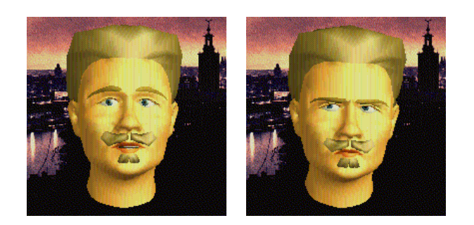
Figure 4: August listening (left) and thinking (right).

The modeling of the gestures in the August project enhances the agent by making him act more natural and more convincing. While we don't claim that these motions are perfect, and certainly not the only