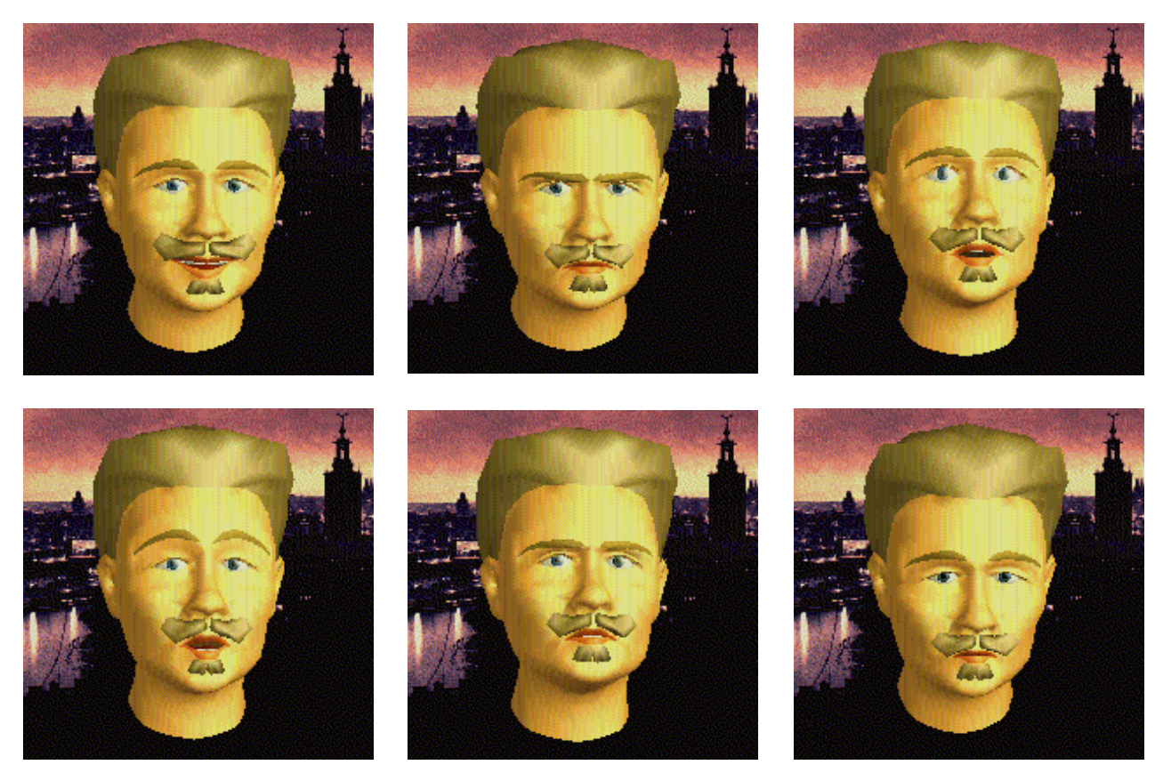
Figure 2: August showing different emotions: Happiness, Anger, Fear, Surprise, Disgust and Sadness.

ward or backward often highlights the ending of a phrase. A number of standard gestures with typically one or two eyebrow raises and some head motion were defined. The standard gestures work well with short answering sentences like "Yes, I believe so." or "Stockholm is more than 700 years old."