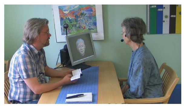
Figure 4. The human-human-computer dialogue setting used in the evaluation. The tutor is sitting on the left side and the subject on the right side

would perhaps be the best, where head pose could be the main method for handling attention, but where a button or a verbal call for attention could be used as a fall-back.