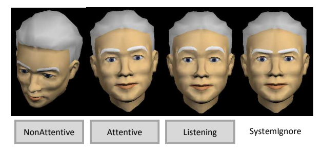
Figure 3. Examples of facial animations triggered by the different states and events shown in Figure 2.

An animated talking head is shown on a display, synchronised with the synthesised speech (Beskow, 2003). The head is making small continuous movements (recorded from real human head movements), giving it a more life-like appearance. The head pose and facial gestures are triggered by the different states in the AIC, as can be seen in Figure 3. Thus, when the user approaches the system and starts to look at it, the system will look up, giving a clear signal that it is now attending to the user and ready to listen.