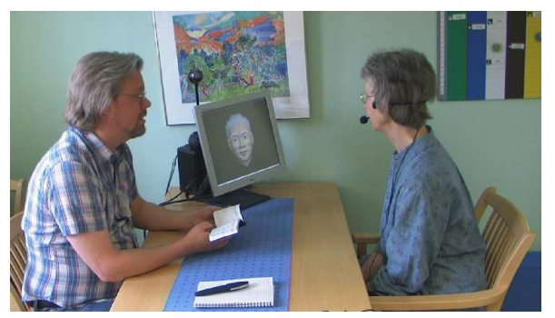
Figure 2. The human-human-computer dialogue setting used in the evaluation. The tutor is sitting on the left side and the subject on the right side

An analysis of the recorded conversations showed that the head tracking version was clearly more successful in terms of number of misdirected utterances. The subjects almost always looked at the addressee in the head tracking condition, and did not start to speak before the animated head looked up. When using the push-to-talk version, however, they often forgot to "turn it off", which resulted in the system interpreting utterances directed to the tutor and started to speak when it shouldn't. The addressee of the utterances in the push-to-talk condition was correctly classified in 86.9% of the cases, as compared with 97.6% in the look-to-talk condition.