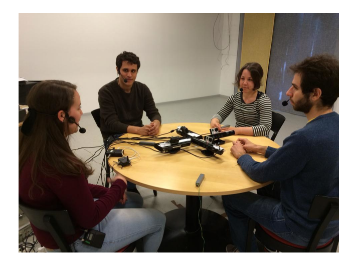
Figure 1: The KTH-Idiap corpus