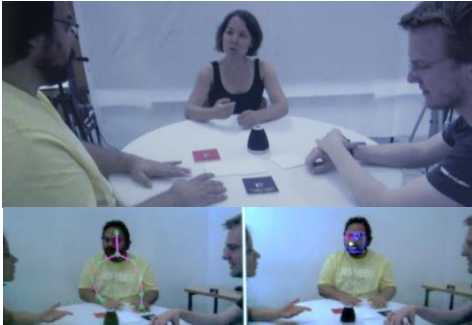
Figure 2. Top: a snapshot of the human-human data collection showing the tutor and the table, containing the colored cards, and the microphone array. Bottom: A view from one of the Kinects showing overlays of the real-time head-pose and torso-skeletal tracking.