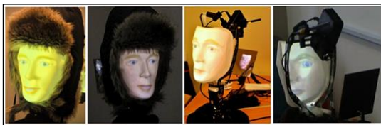
Figure 3. Snapshots of Furhat in close-ups.